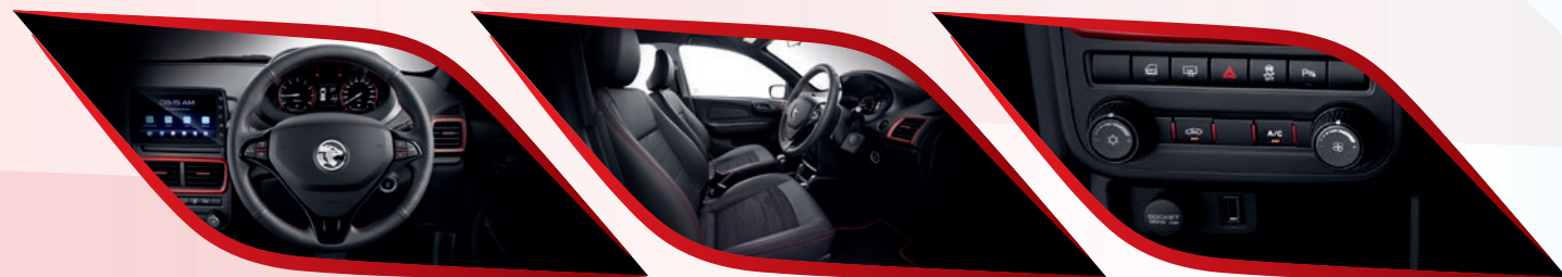
Leatherette Steering Wheel with Switches