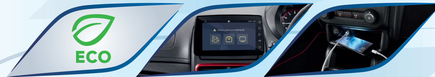
ECO Drive Assist