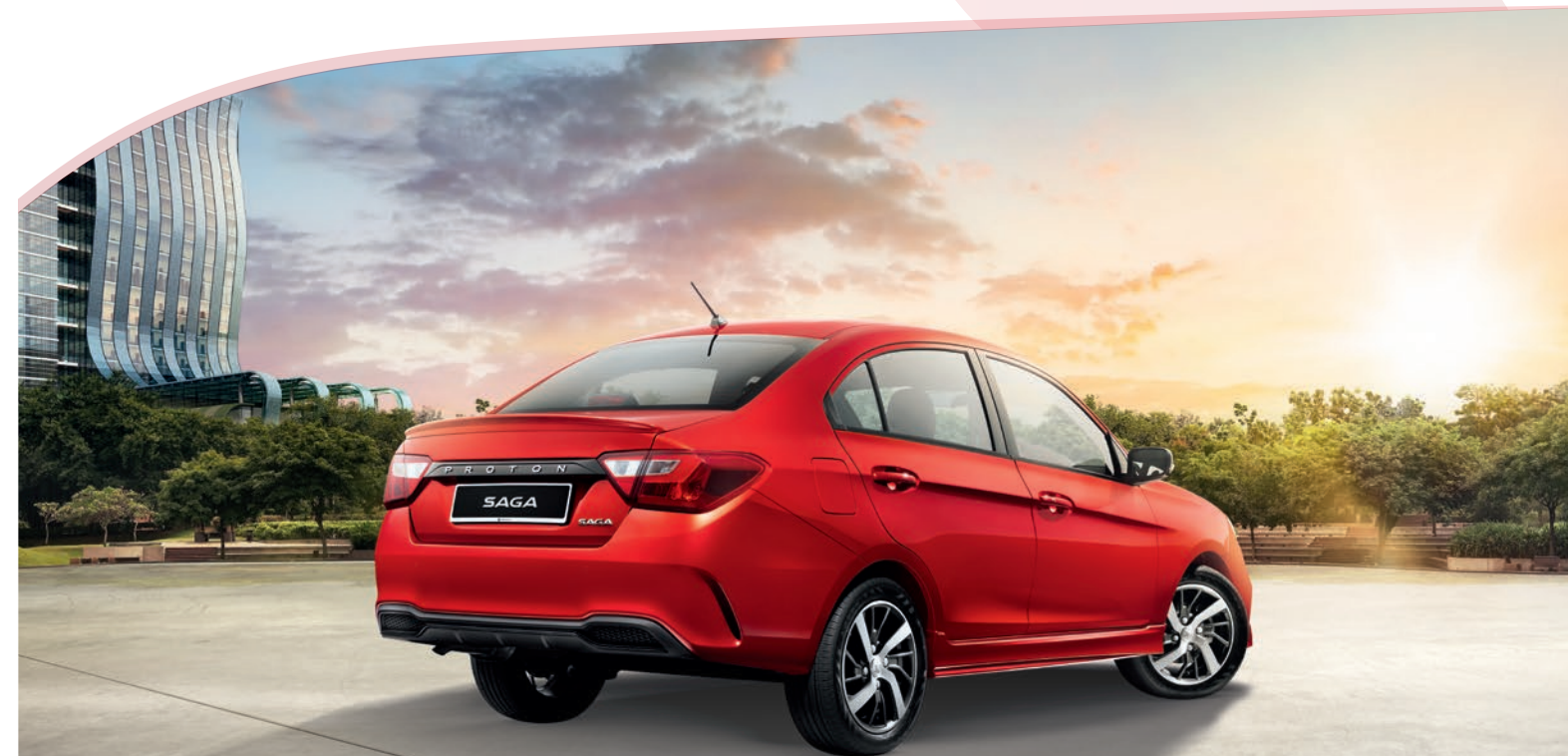
1.3L Premium S AT Semi Leatherette with Fabric