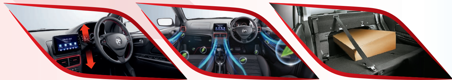
Steering Tilt Adjustment