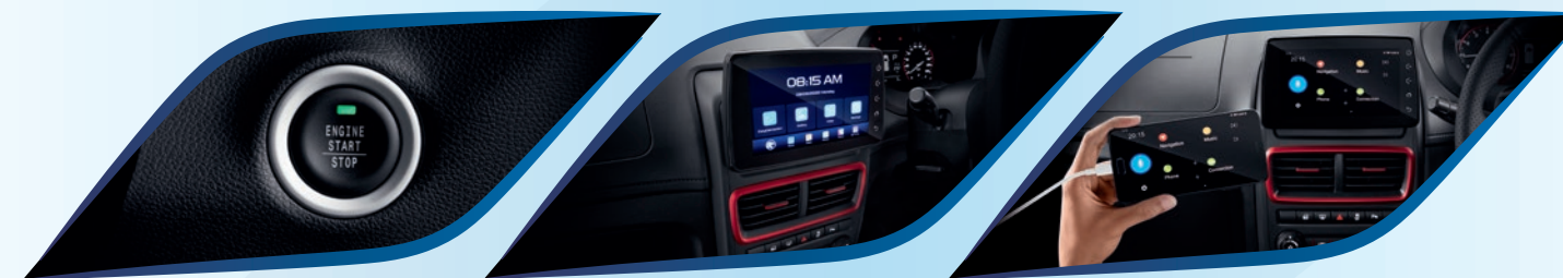
Push Start Button