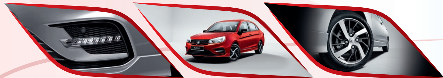
LED Daytime Running Lamps

With features that make your driving experience smoother, you can now turn your attention to the important matter of getting ahead.