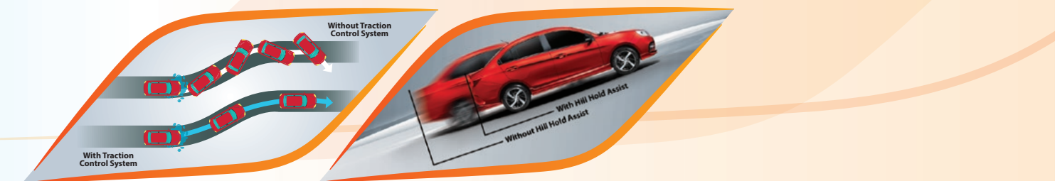
Electronic Stability Control and Traction Control System