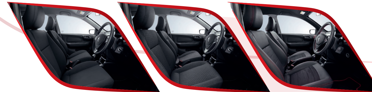
1.3L Standard AT Fabric